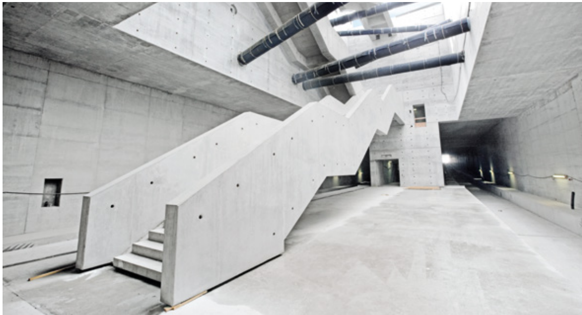
Doka-OptiX enhances pore-free concrete surfaces and enables excellent fair-faced concrete results. City tunnel Leipzig and train stations, Germany