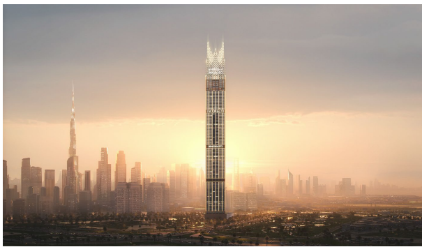
Burj Binghatti Jacob & Co Residences