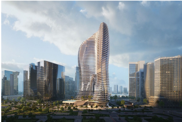
Projects like the Bugatti Residences by Binghatti will redefine Dubai's skyline and set new benchmarks for the construction industry.