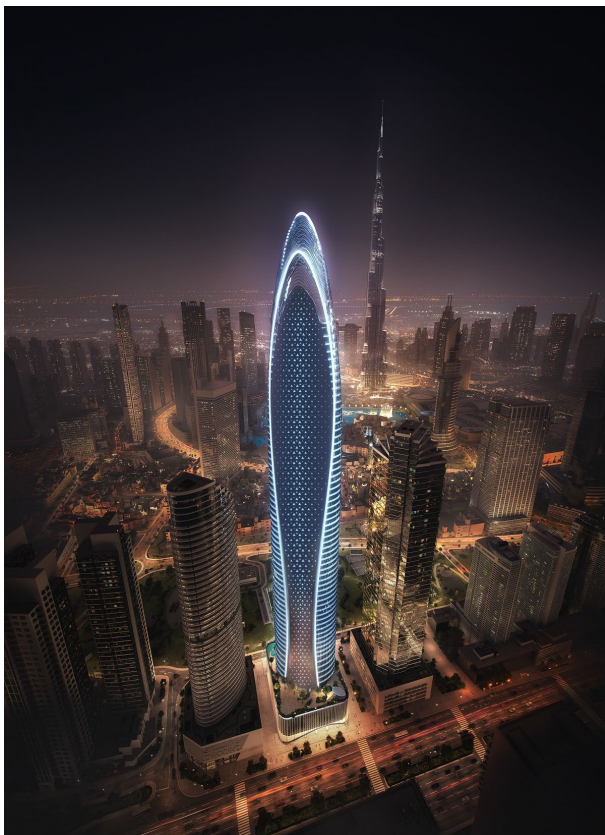
Mercedes-Benz Places by Binghatti in Downtown Dubai is set to captivate with its iconic design and visionary presence.